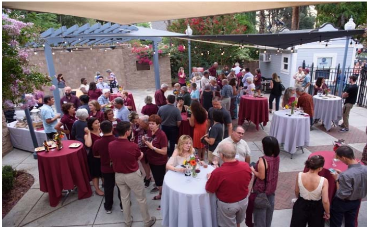
U of R/Town & Gown Night at the Bowl - Reception at Mission Gables Patio – July 30 th