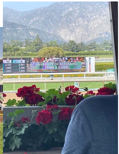
U of R Town & Gown Day at the Races – Santa Anita Park – May 1 st