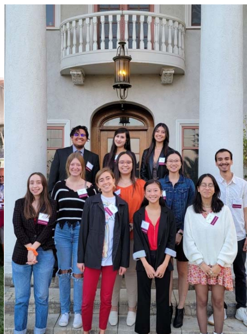
Scholar Reception – Alumni House November 2 nd