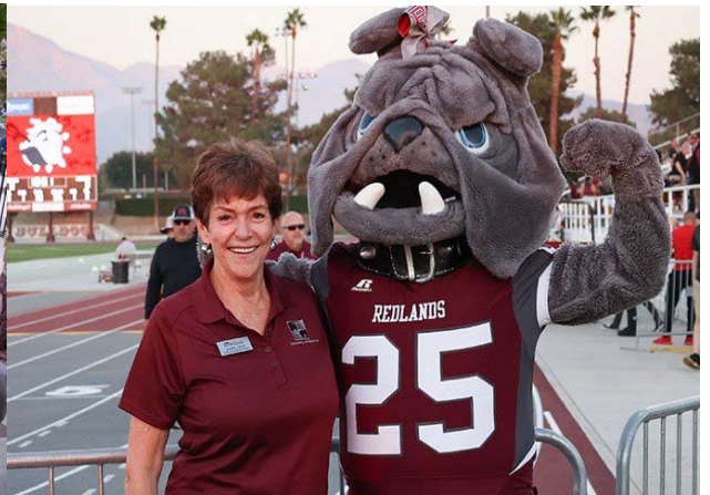
Rah! Rah! Redlands! – September 18 th