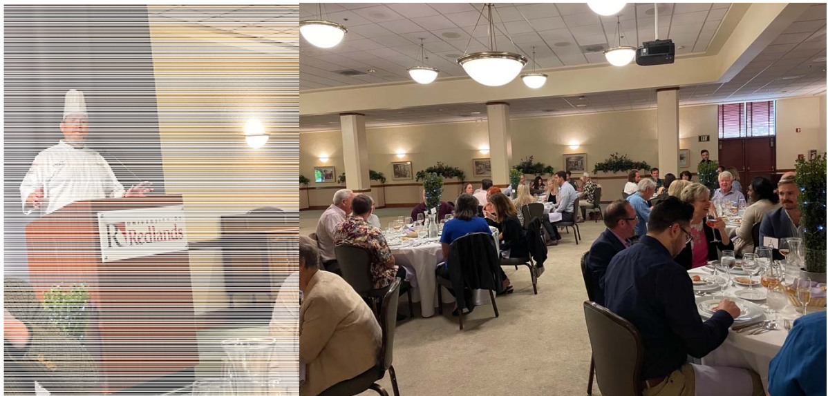
Alumni Vintner Dinner – Casa Loma Room – May 21 st