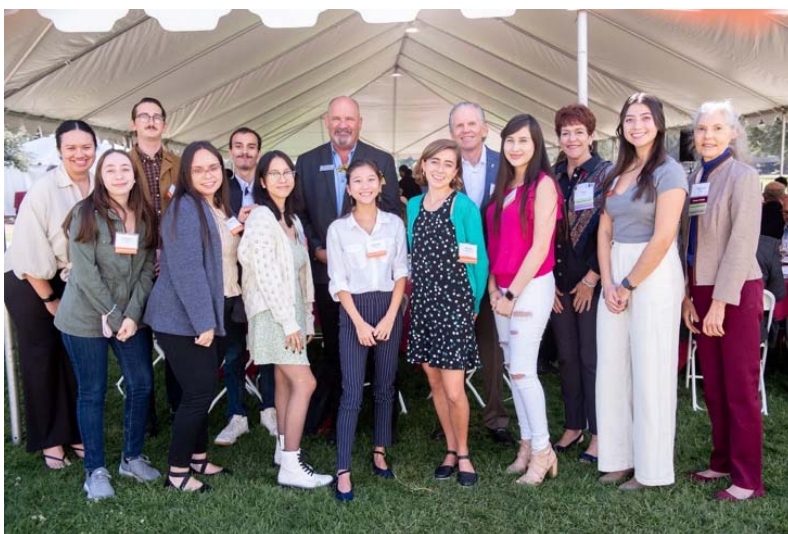
Homecoming – Endowment & Legacy Luncheon – October 22 nd