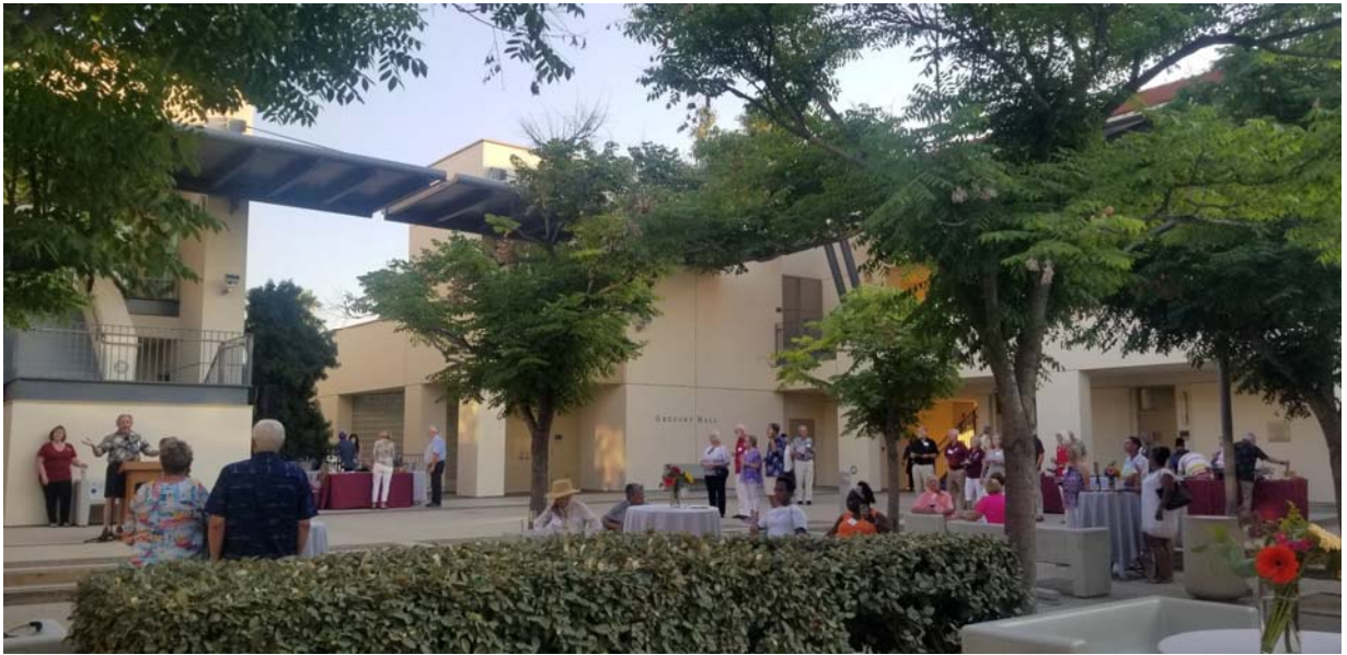
Welcome Back Reception – Talbert Patio – June 30 th