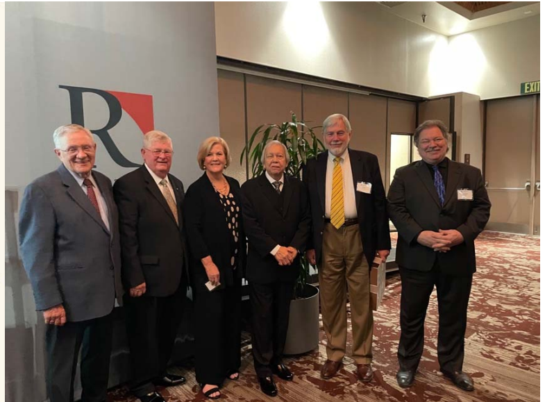
Awards of Distinction Dinner – Orton Center – April 16 th