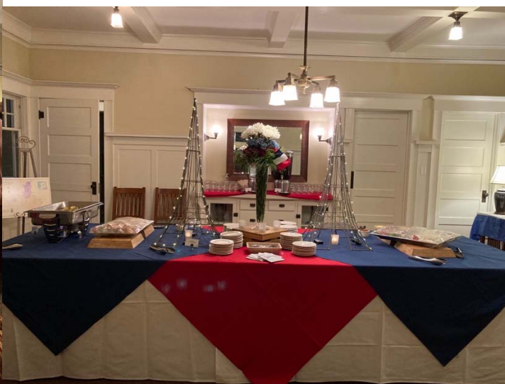
Beaujolais Nouveau Release Party – Alumni House – November 18 th