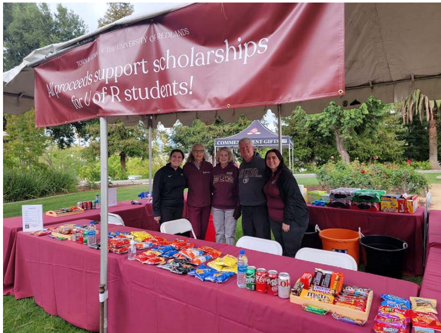
Commencement Booth – Hall of Letters grass area – April 22 nd & 23 rd