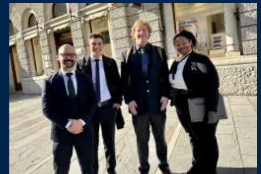
Read the Bulldog Blog about the CONSULTANCY