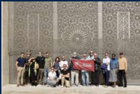
STUDY ABROAD Portugal & Morocco