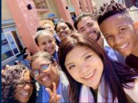
STUDY ABROAD South Africa