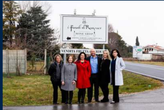
View the StoryMap created by a CONSULTANCY team