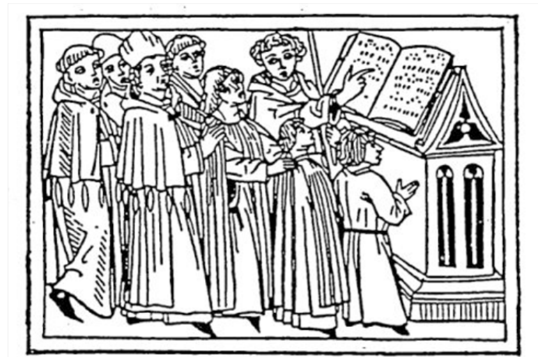
CHAPEL SINGERS & BEL CANTO SINGERS