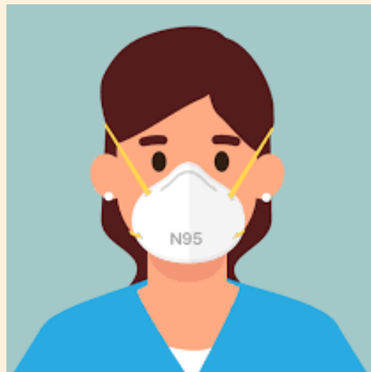
KN95, N95, KF94