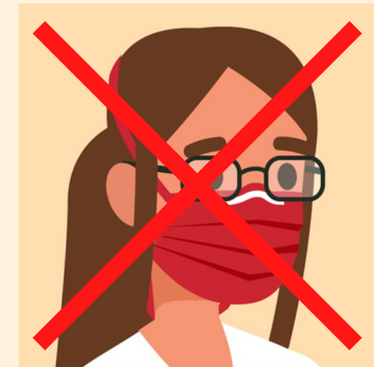
A single layer mask

Gaiter with two layers, or folded to make two layers or Gaiter with N95 filter