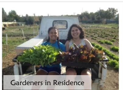
Gardeners in Residence